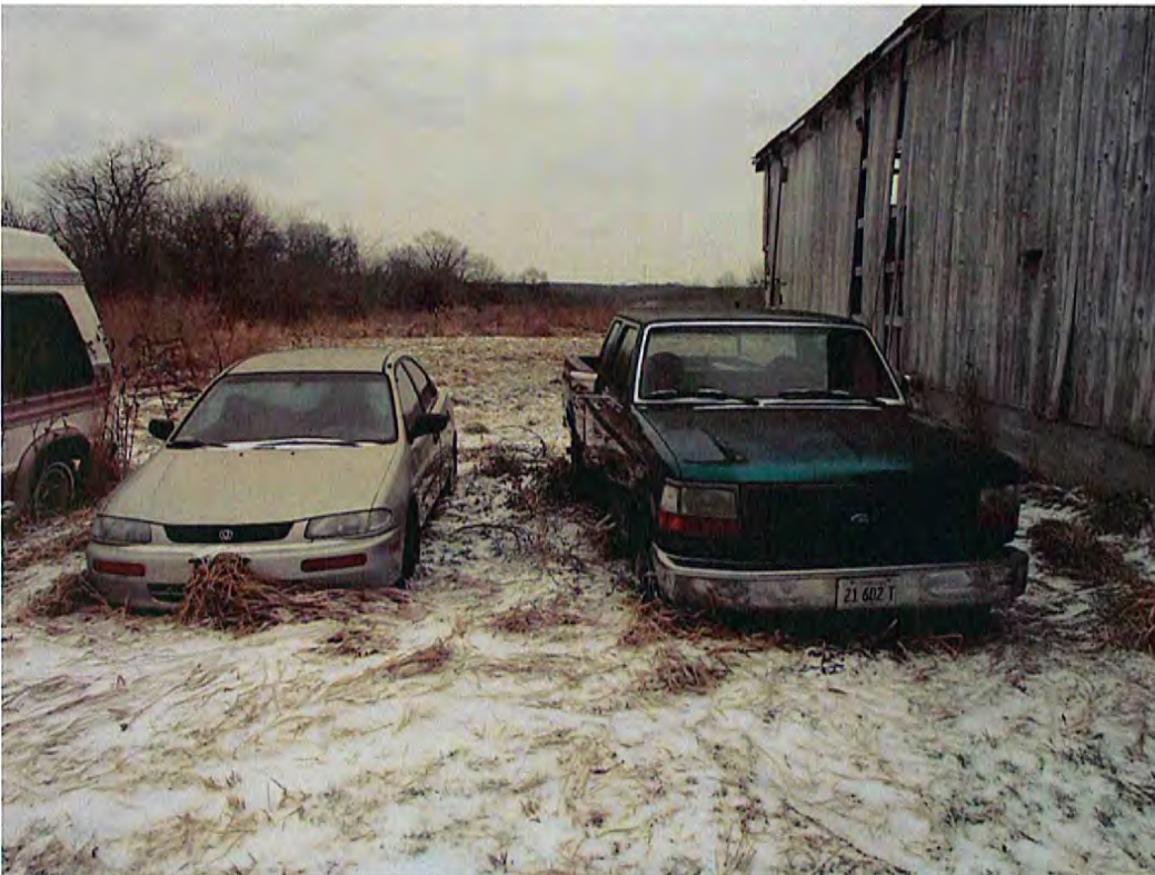
Date: 01/22/2014 Time: 1:37 P.M. Direction: east Exposure #: 022 Comments: waste vehicles; overgrown in vegetation

File Name: 0818105007~01222014-[001-029].jpg