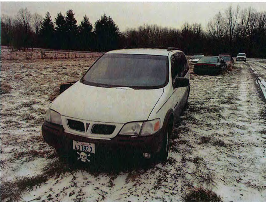
Date: 01/22/2014 Time: 1:39 P.M. Direction: south Exposure #: 028 Comments: waste vehicle

File Name: 0818105007~01222014-[001-029].jpg