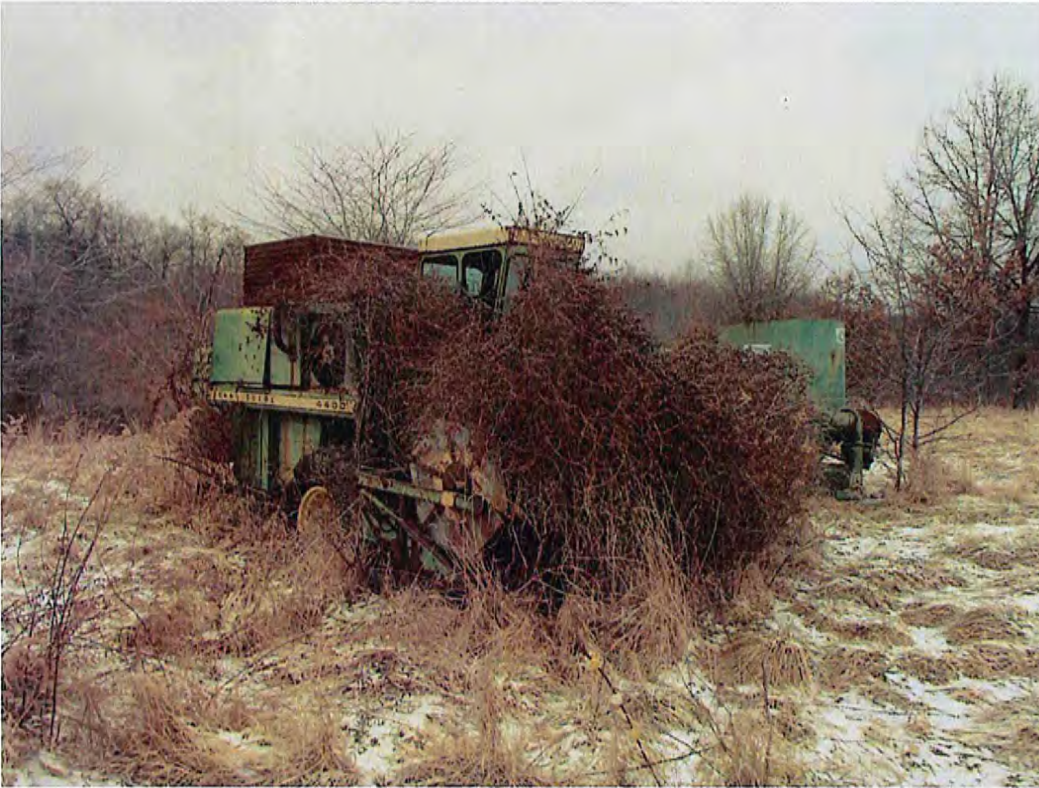
Date: 01/22/2014 Time: 1:36 P.M. Direction: northwest Exposure #: 021 Comments: waste farm implement; overgrown in vegetation