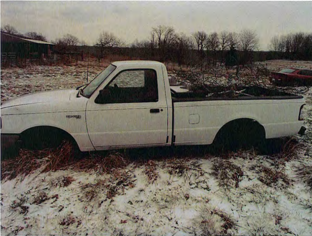
Date: 01/22/2014 Time: 1:39 P.M. Direction: east Exposure #: 027 Comments: waste vehicle