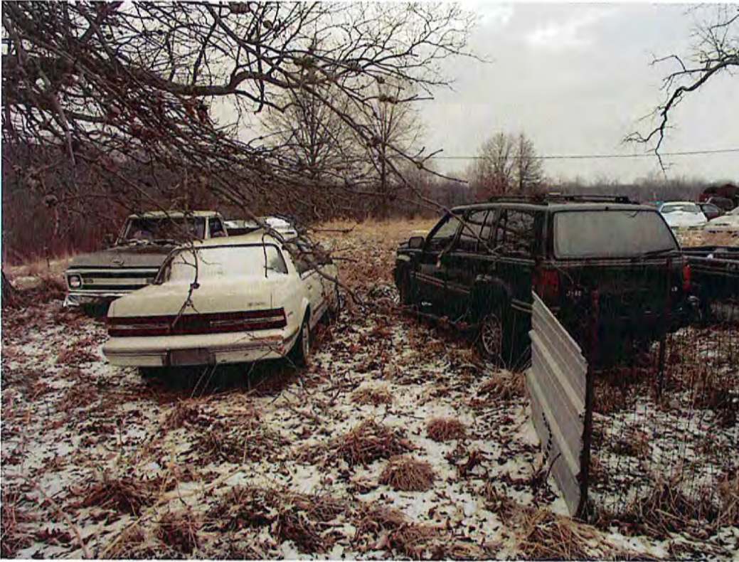
Date: 01/22/2014 Time: 1:33 P.M. Direction: north Exposure #: 009 Comments: waste vehicles