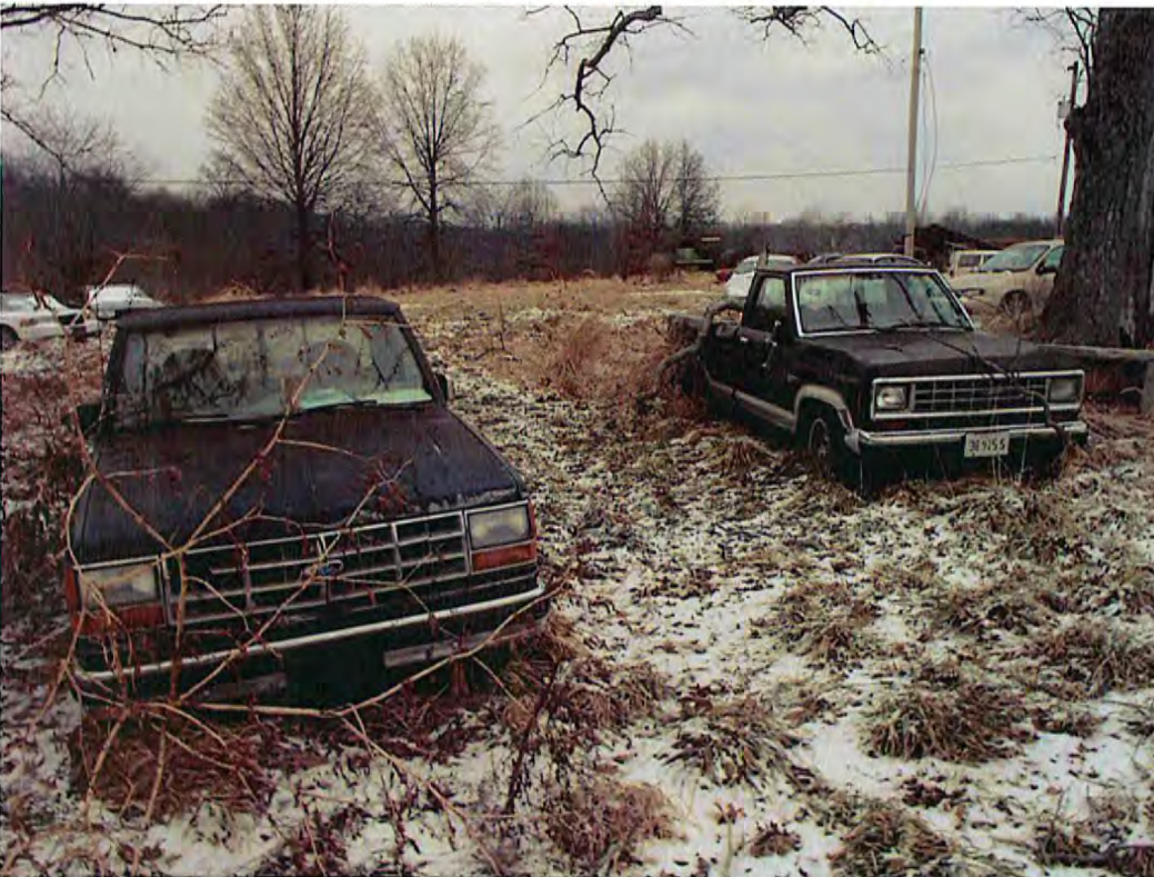
Date: 01/22/2014 Time: 1:33 P.M. Direction: north Exposure #: 010 Comments: waste vehicles; overgrown in vegetation

File Name: 0818105007~01222014-[001-029].jpg